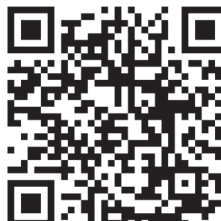
ORDER BIRTH CERTIFICATE