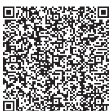
SCIS APPLICATION FORM