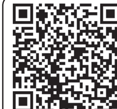
ISC CANADA PLACE ONLINE BOOKING